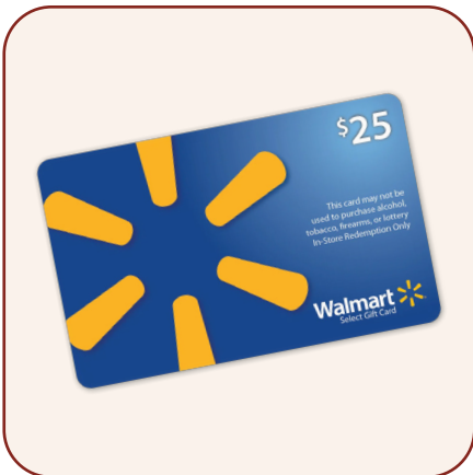
$25 Walmart Gift Card