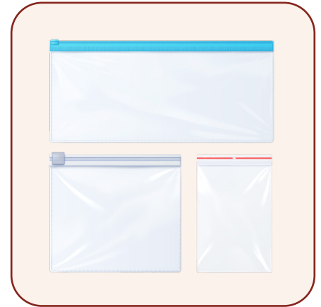
Ziplock bags (any size)