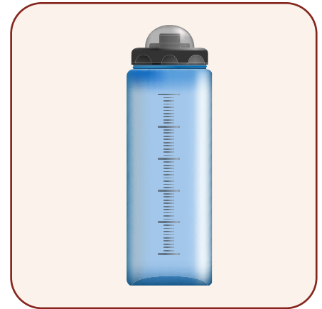
Water Bottle (12 or 18 oz.)