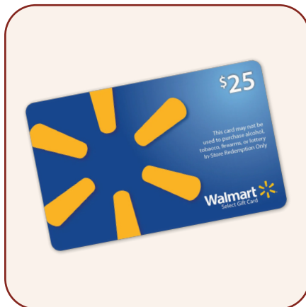
$25 Walmart Gift Card