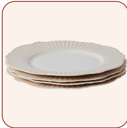
Dinnerware (Set of Four)