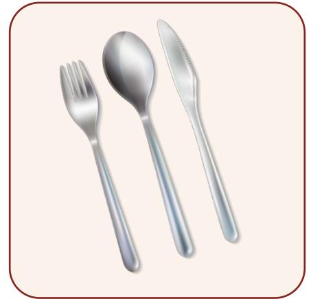
Silverware (Set of Four)