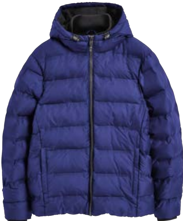
Coats (All Sizes: Adults and Children ages 1-16 years) Kindly only include new or gently used coats